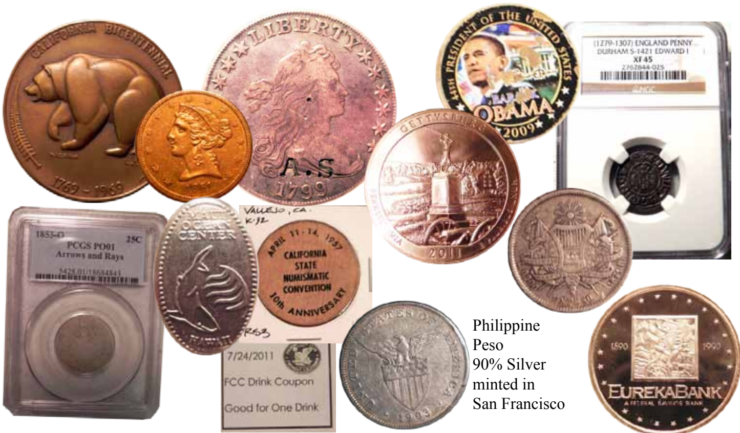
Philippine Peso 90% Silver minted in San Francisco