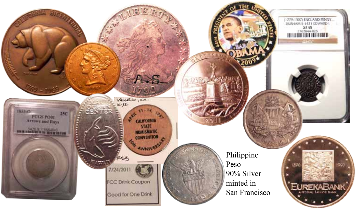
Philippine Peso 90% Silver minted in San Francisco