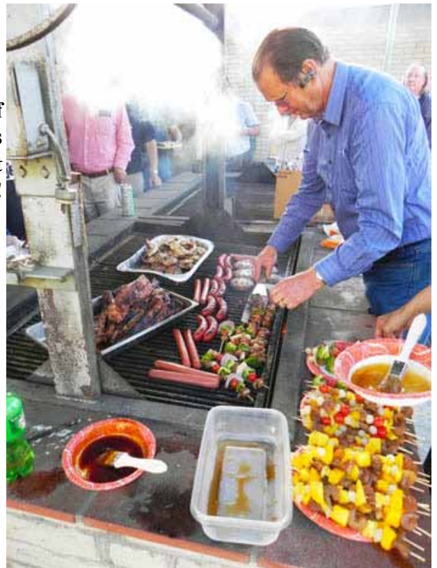
Great Food & Fellowship is what makes OUR club special!