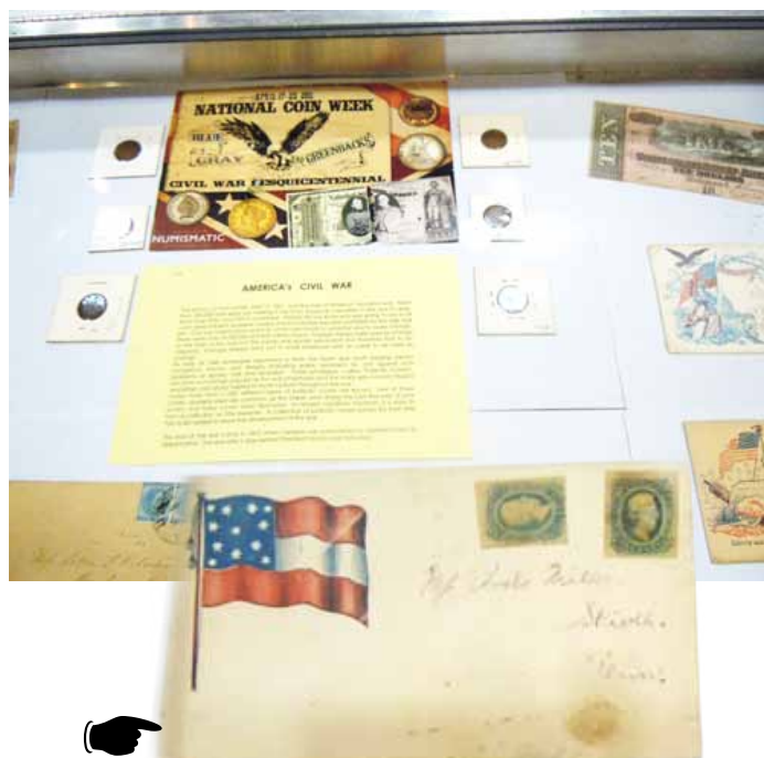
☞ Don Ehlers exhibited several Civil War related items to note its 150th Anniversary.