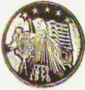
1976 FIRST CLUB MEDAL