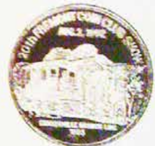
1992 CENTERVILLE BRANCH LINE