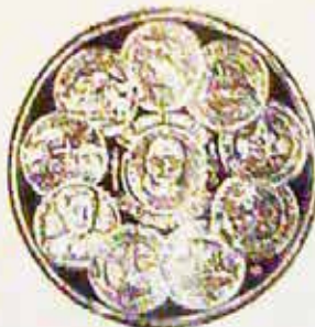
1996 25TH ANNIVERSARY