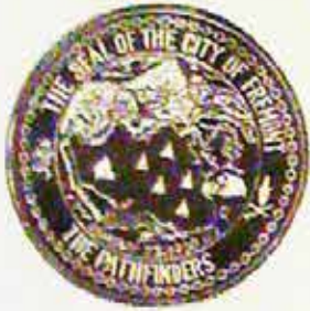
1987 FREMONT CITY SEAL