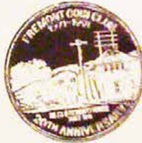
1991 NILES TOWER