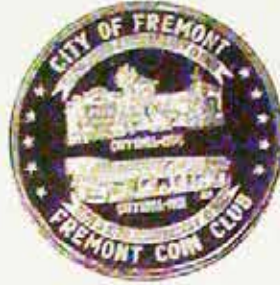
1981 CITY HALL