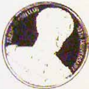
1990 GEN. JOHN C. FREMONT