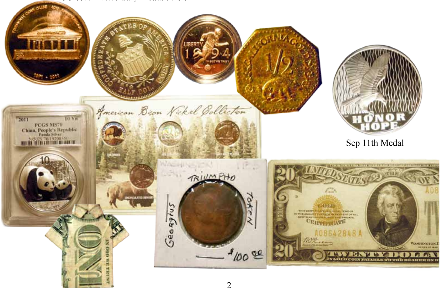
Sep 11th Medal