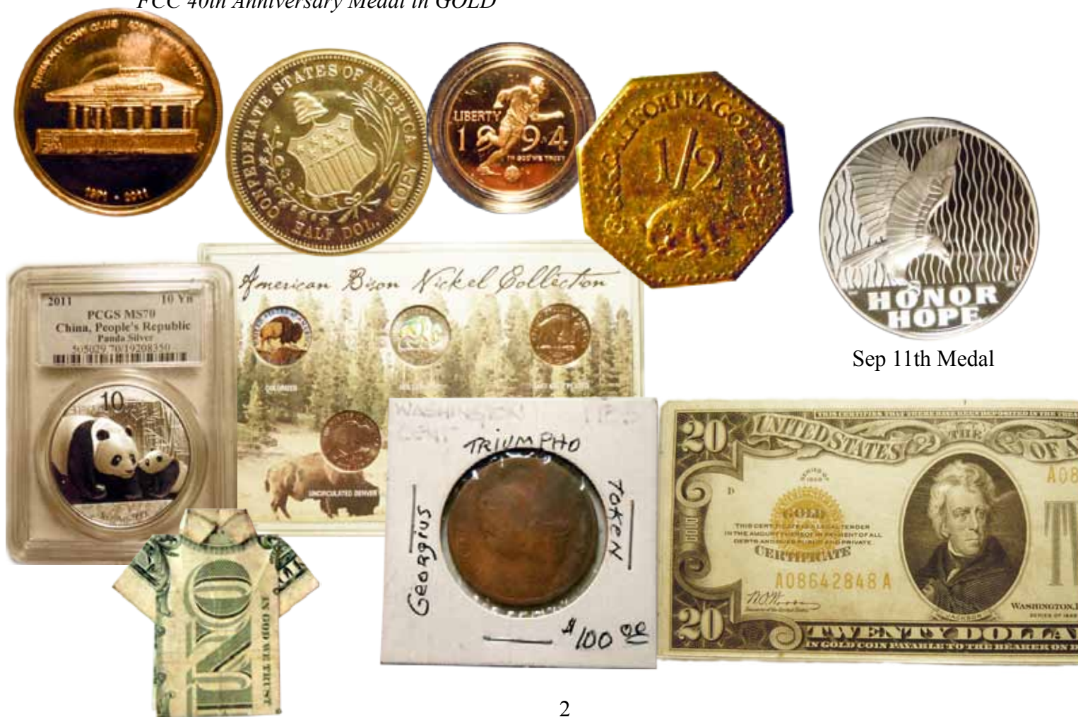
Sep 11th Medal