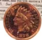
Wowzers! Vince Lacariere brought in a 1898 Proof set!