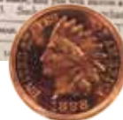
Wowzers! Vince Lacariere brought in a 1898 Proof set!