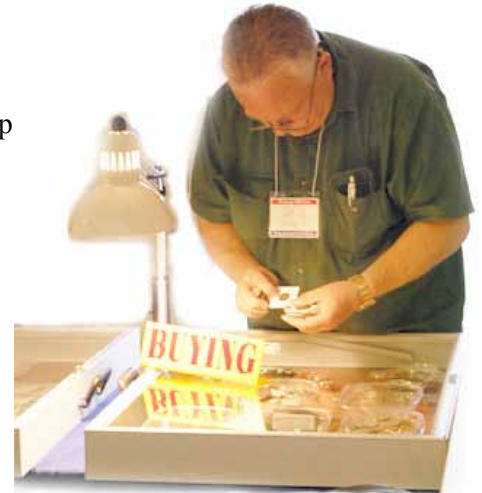
List of Exhibitors mentioned on Page 1.