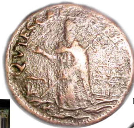
1670 St. Patrick's Farthing