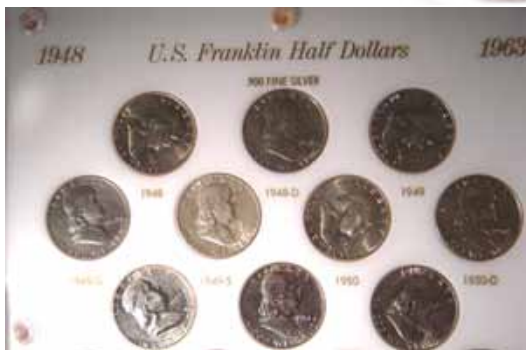
Chuck White rescued this set of Franklin Half dollars in its Capital Plastics holder from the melting pot!