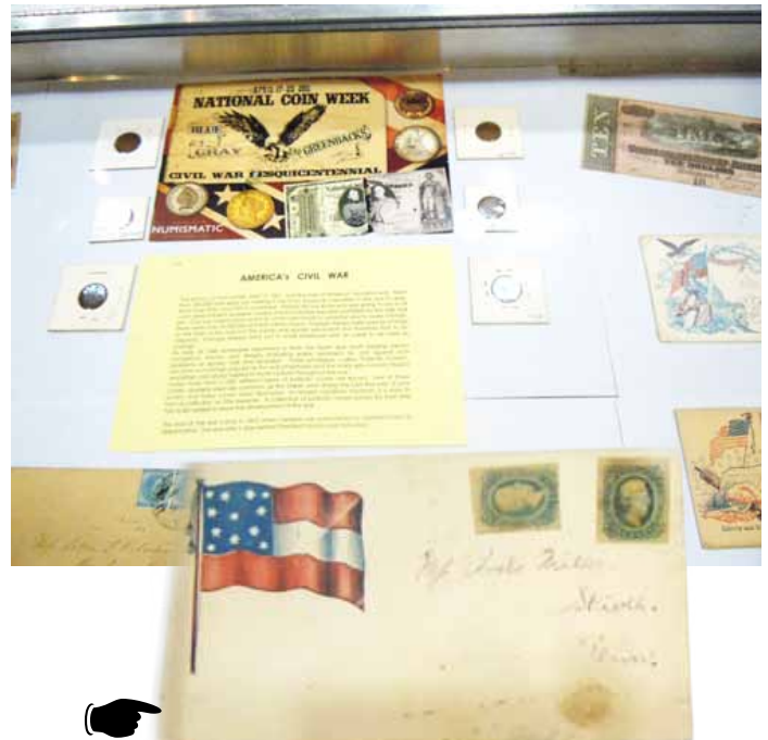
☞ Don Ehlers exhibited several Civil War related items to note its 150th Anniversary.