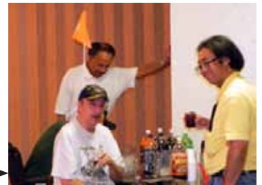
→ FCC Members enjoying refreshments"