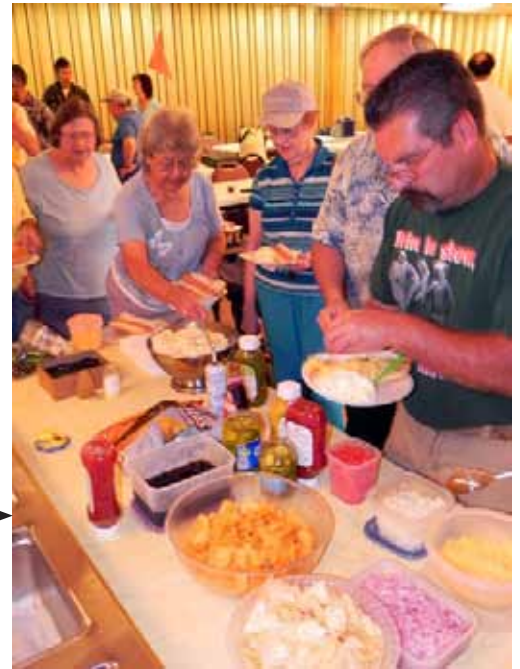
Happy FCC Members → fix'n-up their "Dogs"